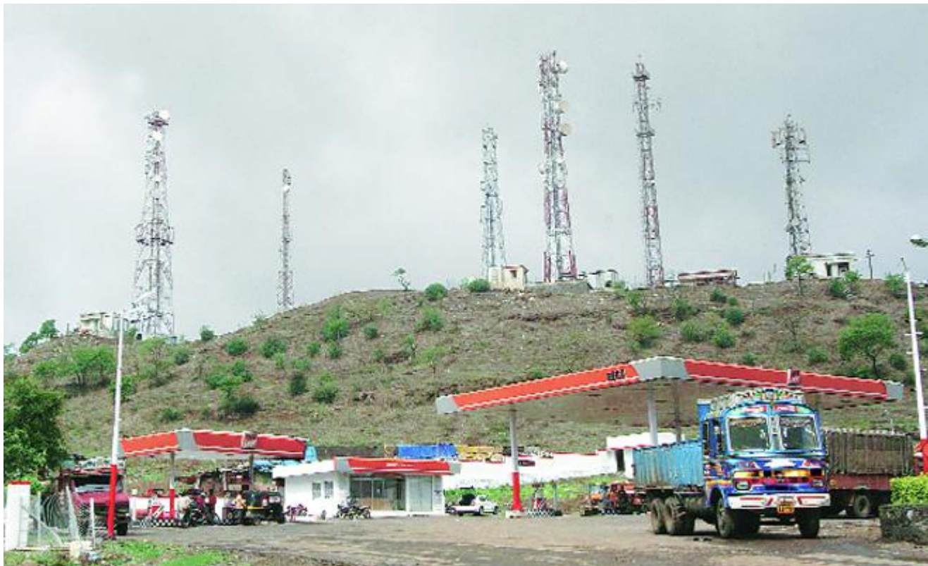
BSNL with Indian

BSNL with Indian Army's help has set up the highest mobile tower in Eastern Ladakh.