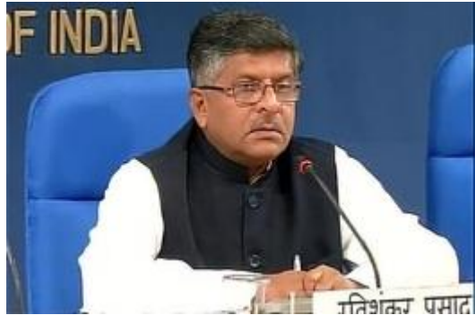
Telecom Minister Ravi Shankar Prasad

Telecom minister Ravi Shankar Prasad has approved a Rs 3,567.58-crore project of state-run Bharat Sanchar Nigam for rolling out mobile networks in nine Maoist affected states.